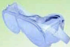
STA-0035 安全護眼罩 Safety Protective Eyewear