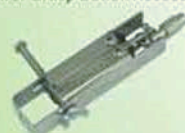
STA-0005 上部工字鈕夾具 Upper Grasp Button Grip