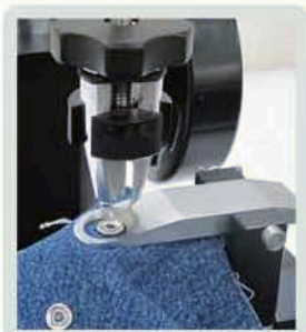
指針式推拉力計 Analog Pull And Push Gauge

According to standard rules, when the sample is in the test, it must be in the vertical position to make it the same as the test force. The test sample should stand 17 pounds (about 7.73kg) about 10 sec. If it can not reach this standard, it will be approved that the products is not in the safe range. Otherwise some interference factors exist in the operation.