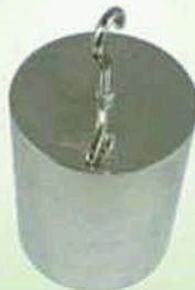
STA-0004N 30N 標準砝碼 Standard Weights