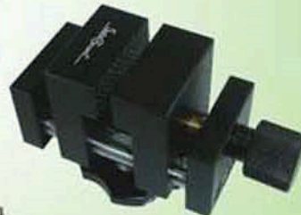
STA-0084 專用拉鏈鉗座 Vise Clamp For Zip