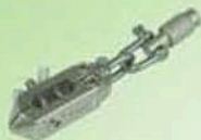
STA-0002 上部凸面五爪鈕夾具 Upper Stud Grip