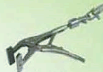
STA-0007N 專用拉鏈夾具 Special Zip Fixture