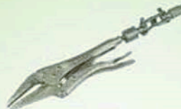
STA-0041B 上部四孔鈕/牛仔褲鈕三爪鈕夾具 Upper Three Pronged Grip